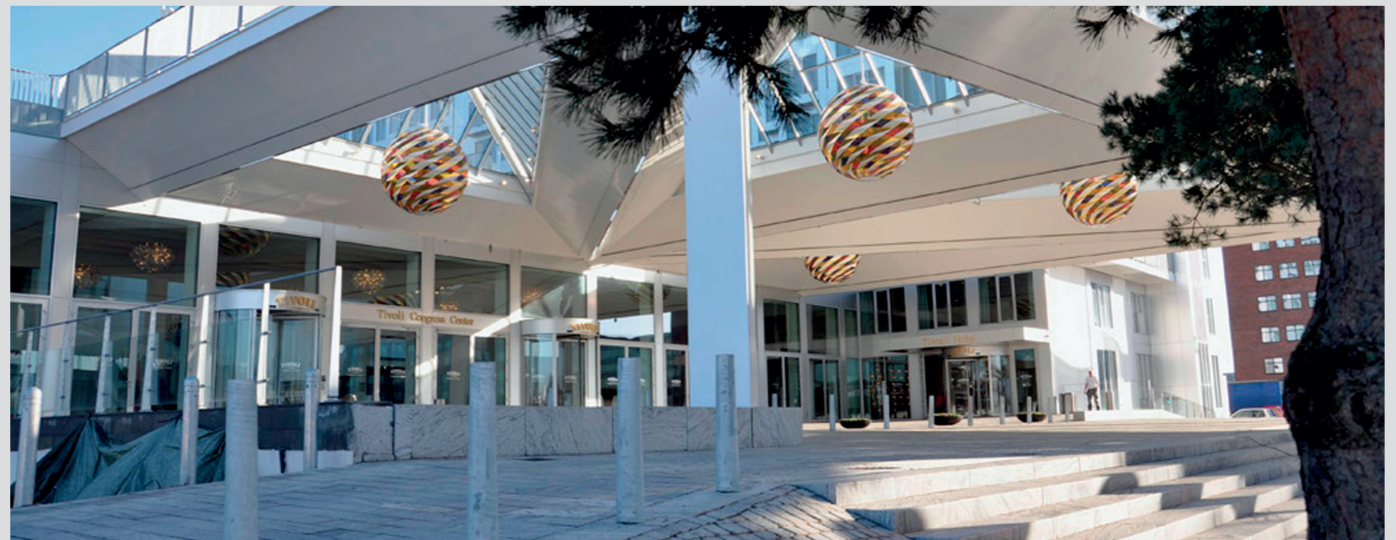
Tivoli Hotel & Congress Center.